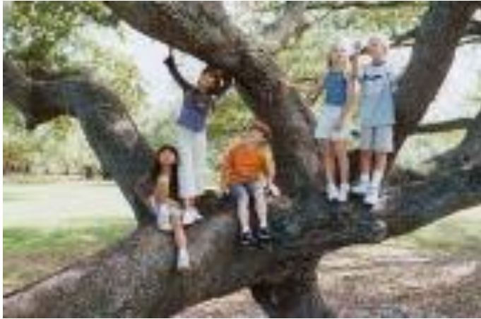
Falling off a tree

The reason that we need to understand risk, and in particular high risk, is that (usually) the higher the risk, the greater the consequence if it turns out 'wrong'.